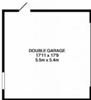
GROUND FLOOR APPROX. FLOOR AREA 1072 SQ.FT. (99.5 SQ.M.)